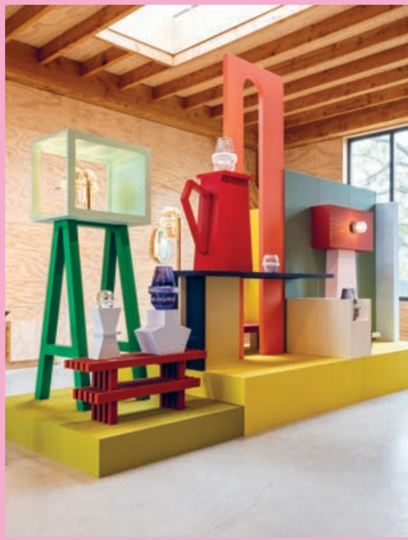
This is a publication by Eindhoven Design District. Copyright 2024.

Both seasoned design enthusiasts and the 'just curious' crowd can unlock the design power of Eindhoven Design District with this map!